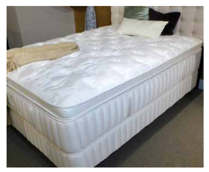
OLD AND NEW Kingsdown's expanded Vintage collection delivers understated elegance, while bridging the gap between the Mebane, North Carolina-based company's Crown Imperial and Diamond Royale lines.

Mebane, North Carolina-based mattress maker KINGS - DOWN added four Elite models to its Vintage collection, which launched at the Fall High Point Market in October. The new mattresses bring the Vintage collection to 11 models, which are priced from $1,699 to $6,000.